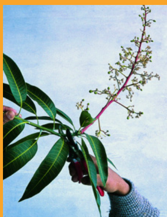
Fig. 11. Removal of inflorescences during training of mango trees.