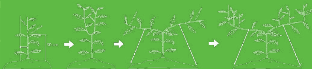
Fig 6. Training of trees combining bending and pruning.