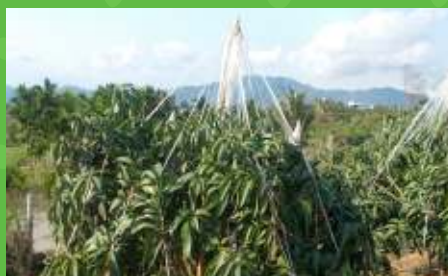
Fig. 10. Propping pendulous mango branches (Hainan, China).

Even with adequate pruning, some trees (particularly cultivars with long spreading habit like 'Keitt' and especially young trees when heavy loaded with fruits) will require additional support for low branches to avoid