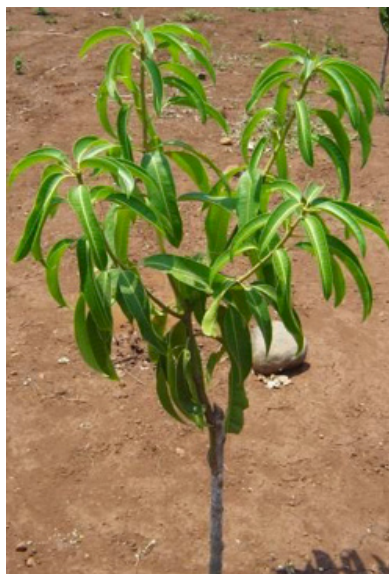
Fig. 3. Young tree formed by 4 initial shoots coming from different points and with appropriate angles. Good canopy structure for heavy fruit load.

A somewhat different approach to training has been recently proposed in Florida with a system that offers the possibility of training by combining bending with pruning following the procedure by Ledesma et al., (2016) which is described as: The grafted plant is tipped at 50 cm to induce precocious branching, maintaining two shoots which are tipped after the second vegetative flush. Then each branch is bent, pulling it down to the horizontal (fig. 6). This system has