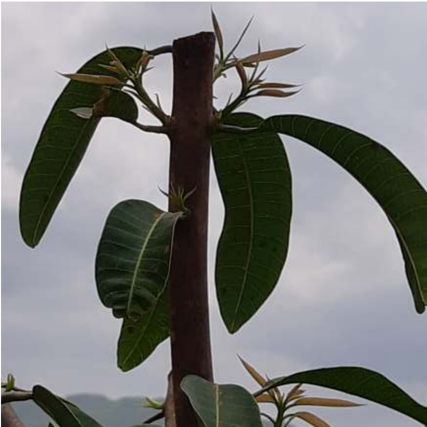
Fig.1 Initial pruning cut during training.

The following steps should be followed both in the tropics and in the subtropics for training young trees. (Fig.1-5).