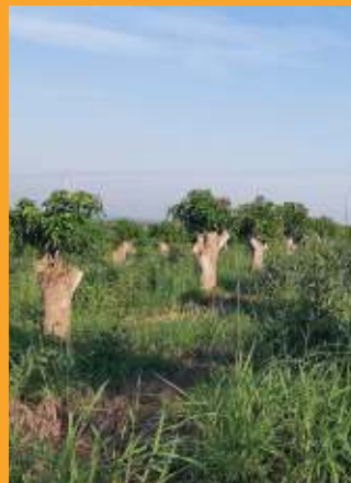
Fig. 14. Pruning for tree rejuvenation.