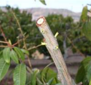
New shoots emerging after pruning.