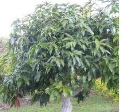
Tree at the end of the summer.