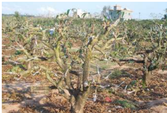
Fig. 17. Topworking trees (Hainan, China).

The procedure for varietal change basically does not differ from that indicated for rejuvenating old trees except that the cuts should be done below the grafting point (fig.15-16) unless having an interstock is desired. After the pruning, one should either do top working of the main trunk or grafting with the new cultivar on the selected emerging shoots produced after pruning. A different approach is taken in China where no pruning is done but all the terminals are grafted with the new cultivar (Fig.17). Although this may be quicker, it is generally too expensive especially in big trees due to the cost of hand labour.