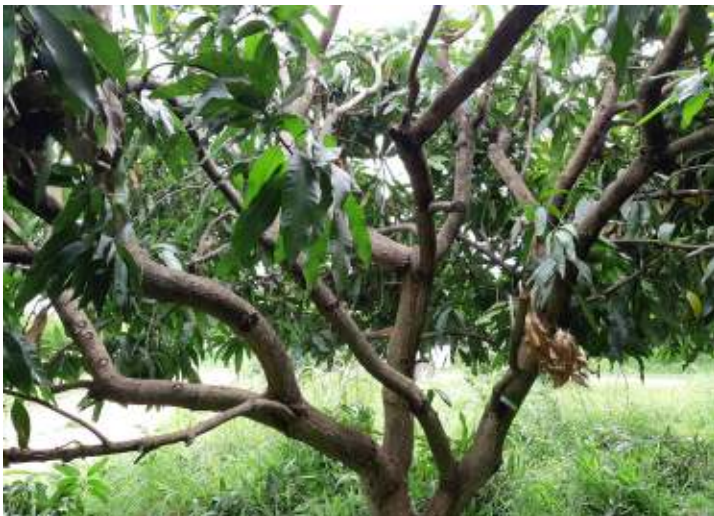
Fig. 8. Canopy opening

an angle of insertion lower than 45° and all shoots growing toward the inside of the canopy to allow air movement and better light penetration, reducing incidence of pests and diseases, producing more colored fruits, and having the additional advantage of obtaining cauliflory flowering in old wood (fig.8). This operation, as well as the removal of low branches, should preferably be done at the end of the winter to avoid burning of the exposed internal branches due to excessive hot weather or excessive sunlight. However, opening the canopy is not recommended in the subtropics because, due to the slower rate of vegetative development after pruning,