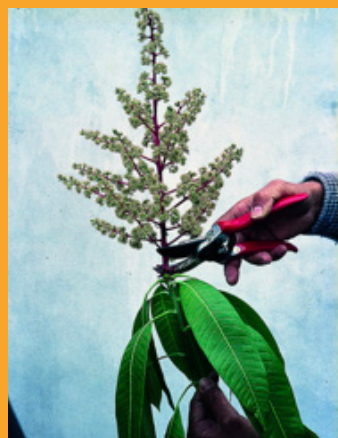
Fig. 12. Removal of the first flowers and emission of a second flowering in the subtropics.

flower induction and emission of a second flowering.