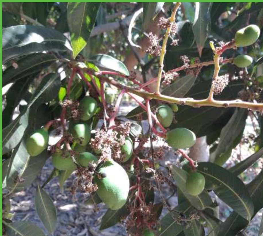
Fig. 13. Appropriate phenological stage for fruit thinning.