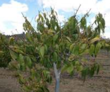
Tree (cv. Keitt) with high production in the precedent year (seen in next spring year 'OFF').