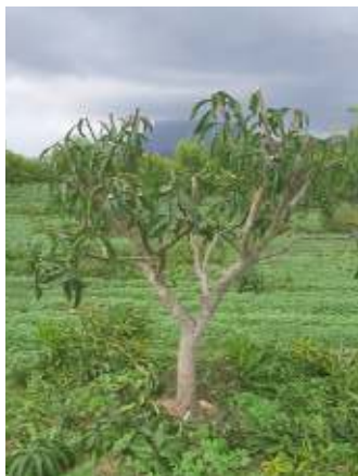
Fig. 4. Three year old tree formed from 3 initial shoots coming from different points and angle with the stem. Good strong canopy structure.

Mangos can also be trained to grow on trellises with several strings at different heights. The plant should be allowed to grow to the height of the first string, and then the stem should be cut to obtain three shoots. Two of them will be conducted laterally along the string and the other will be allowed to grow erect until it reaches the second string when the process is repeated for the third string. Trellis systems are common in greenhouse cultivation in subtropical locations of Málaga, Spain, and in El Algarve, Portugal, at planting distances of 2.5 x 2.0 m with three horizontal wires, at around 1.00,