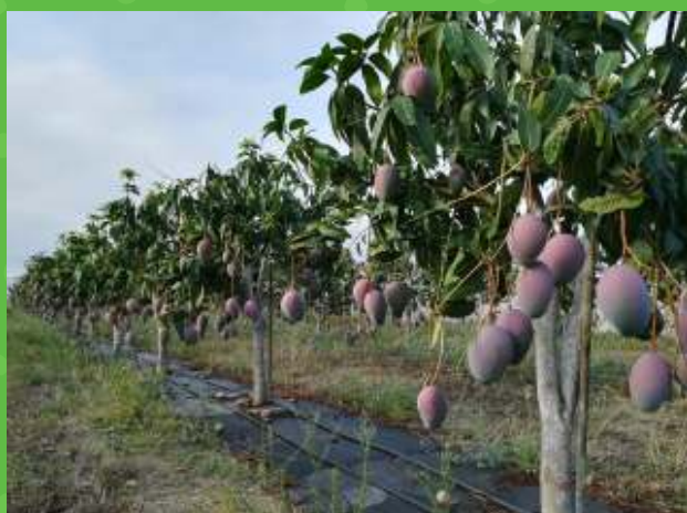
Fig 7. Conduction of mangos in trellises.