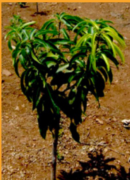
Fig. 2. Young tree formed by 5-6 initial shoots coming from the same point of the stem. Weak tree susceptible to breaking by excessive fruit load.

By the end of the third year after planting in the tropics or more preferably after the third cut, if the trees have developed a sound structure, the mango plant may be allowed to flower, either naturally if low temperatures conducive to flowering occur or by using growth regulators, stopping irrigation and/or nitrate sprays. The last cut is better done in early autumn to take advantage, when possible, of low winter temperature - inducing flowering.