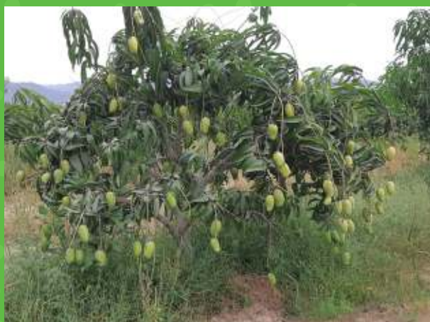
Fig. 5. Young tree formed from 3 initial shoots coming from different points and angle with the stem with heavy load.